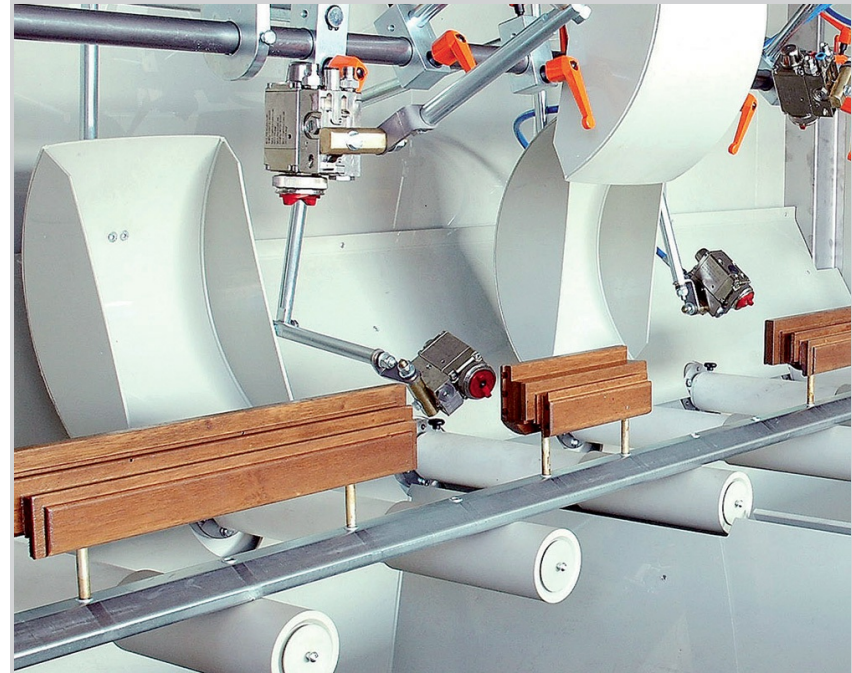
Detail of guns easy to adjust, vats and protection guards in Moplen for simple and quick cleaning