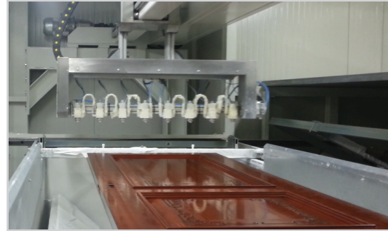
RECIPROCATOR for panel